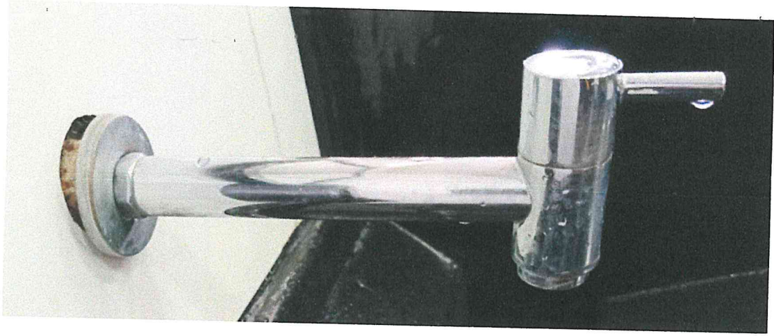
Lavatory Faucet (Long)