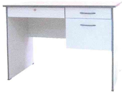
Modern Office Table with Center and 2 side drawers, PVC edge Size: 1200 x 600 x 750mm Color: Light Grey