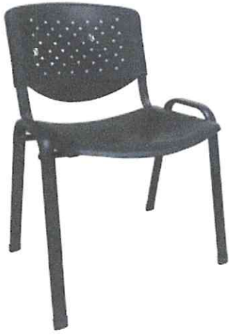
Stackable waiting mesh plastic chair Size: 460 x 568 x 790mm Color: Black