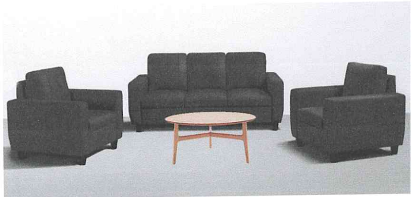
Sofa Set 3-1-1 Fabric with throw pillow & center table Size: 3 seater – 65”L x 24”D x 31”H 1 seater – 30”L x 24”D x 31”H Color: Black Center Table – 80cmW x 45cmH x 80cmD Color : Natural / Walnut