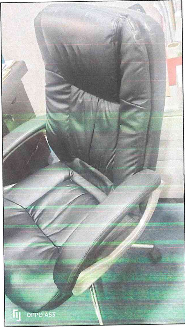
ITEM # 3