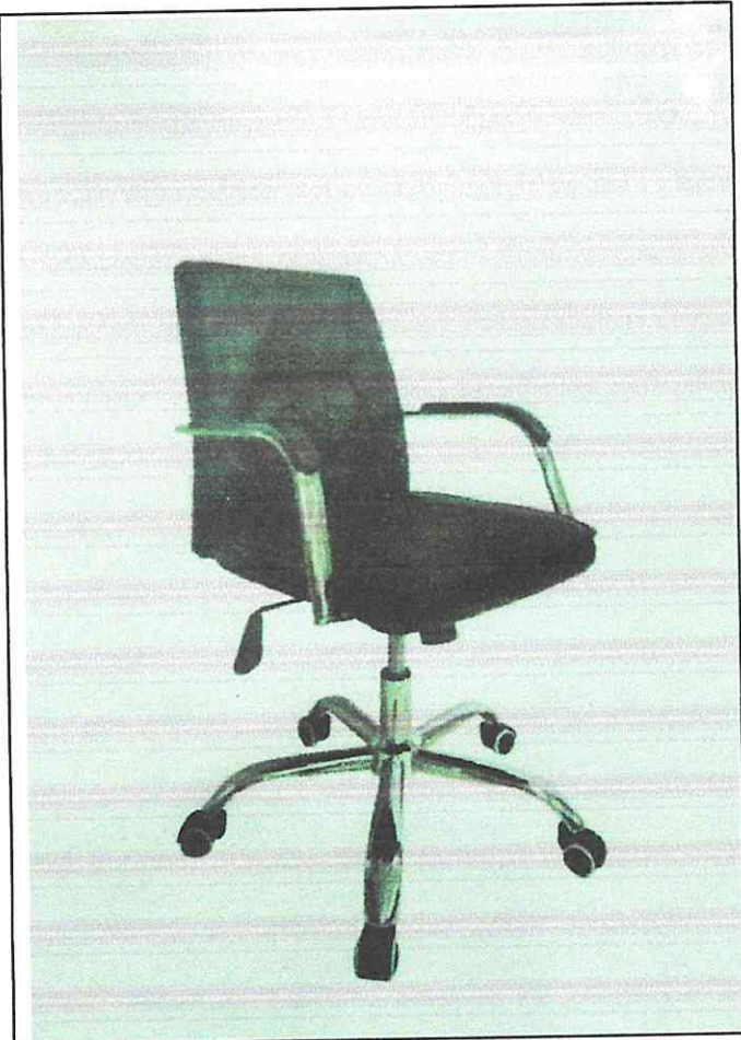
ITEM # 4